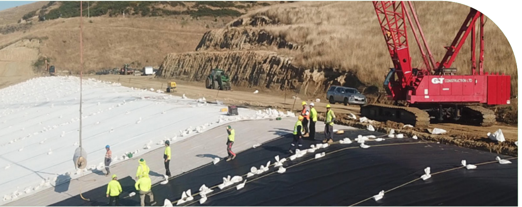
The construction of the landfill liner (plus Siltstone layer)