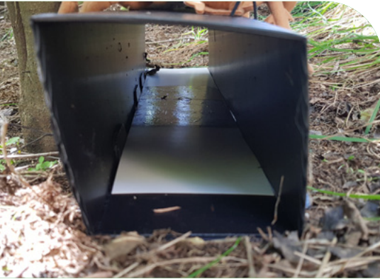
Animal tracker (1)