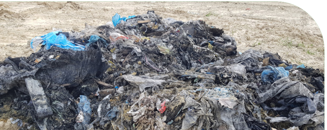
A pile of waste approximately ten years old