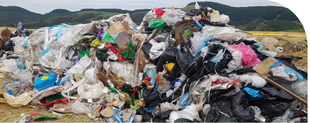
A fresh pile of waste at the Kate Valley landfill