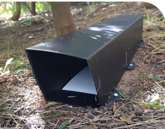
Animal tracker (2)