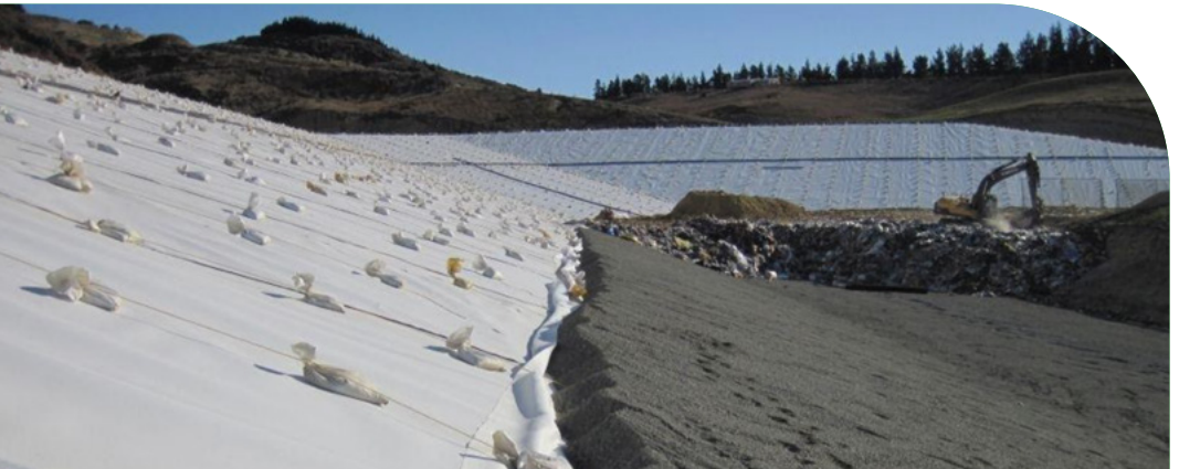
The landfill liner (plus Siltstone layer)